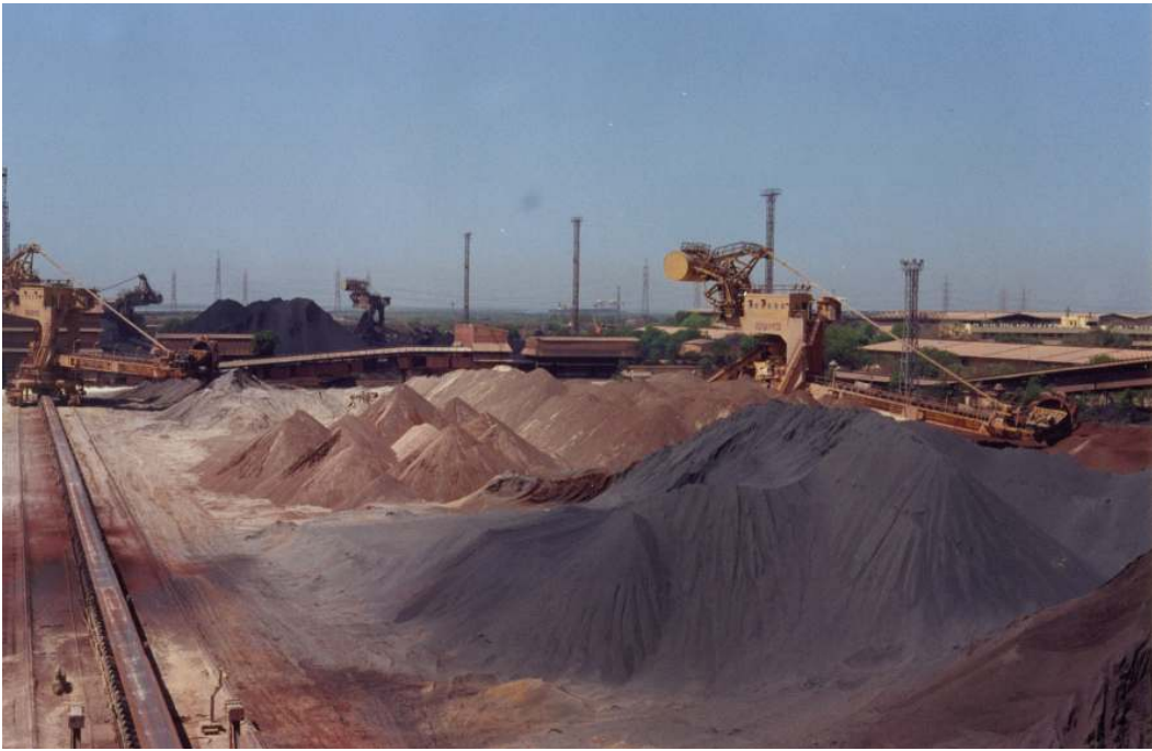
Photograph C for Question 4