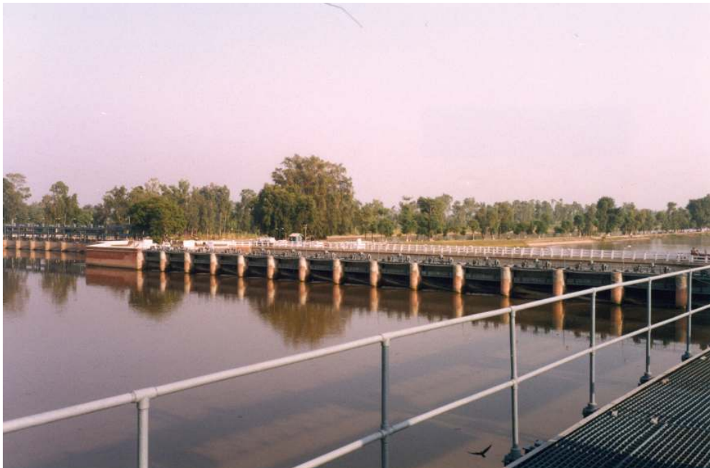
Photograph B for Question 1