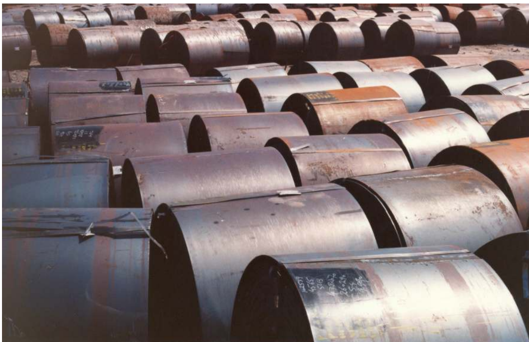
Photograph E for Question 4