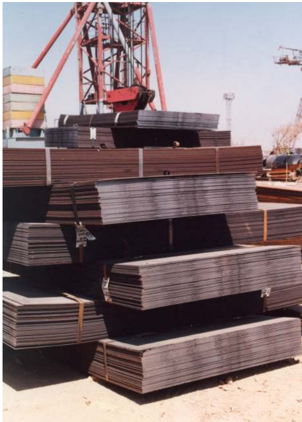
Photograph D for Question 4